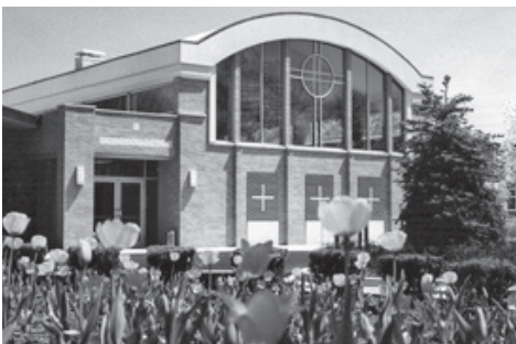
St. Paul of the Cross Retreat Center Detroit, Michigan

While many of us in the Midwest were wondering if our challenging spring would ever yield to a genuine summer, we Oblates of the Detroit-Toledo Province gathered June 20-24 for our annual Assembly. We came from California, Toronto and western New York, from as close by as Toledo, Monroe and Detroit, from as far away as the Virgin Islands, Mexico, Brazil and Haiti, from Pennsylvania, Florida and Washington, D. C. to gather as one at St. Paul of the Cross Passionist Retreat Center in Detroit.