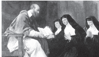
St. Jane de Chantal receives the Visitation Constitutions from St. Francis de Sales